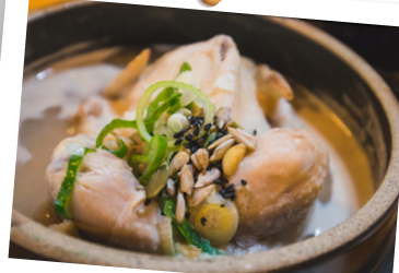
人参鸡汤 / Ginseng Chicken Soup