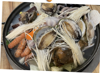
海鲜火锅 / Seafood Steamboat