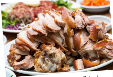
韩方猪蹄定食 / Hanbang Jokbal